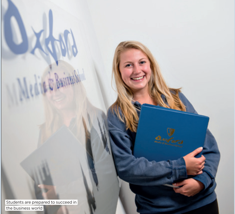
Students are prepared to succeed in the business world

A 2017 graduate said, 'OMBS has been one of the best things I have ever done. It still hasn't sunk in yet where I will be working!'