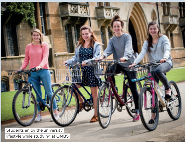
Students enjoy the university lifestyle while studying at OMBS

Speaking about her experience at the school, a former student says, 'It is clear that the Executive PA Diploma at OMBS set the foundations for my career. Although I was very capable of going to university, I decided that this pathway would be more beneficial to my career. I haven't looked back since choosing OMBS over my place at St Andrews University'.